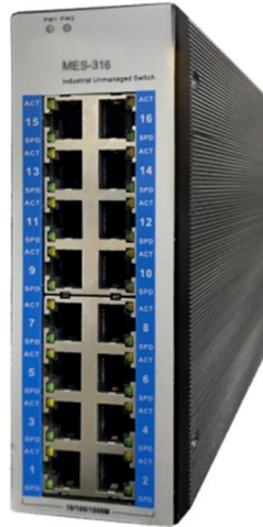
16*GE Copper Unmanaged Industrial Ethernet Switch Size: 148*51*165 mm, DIN Rail-mounted