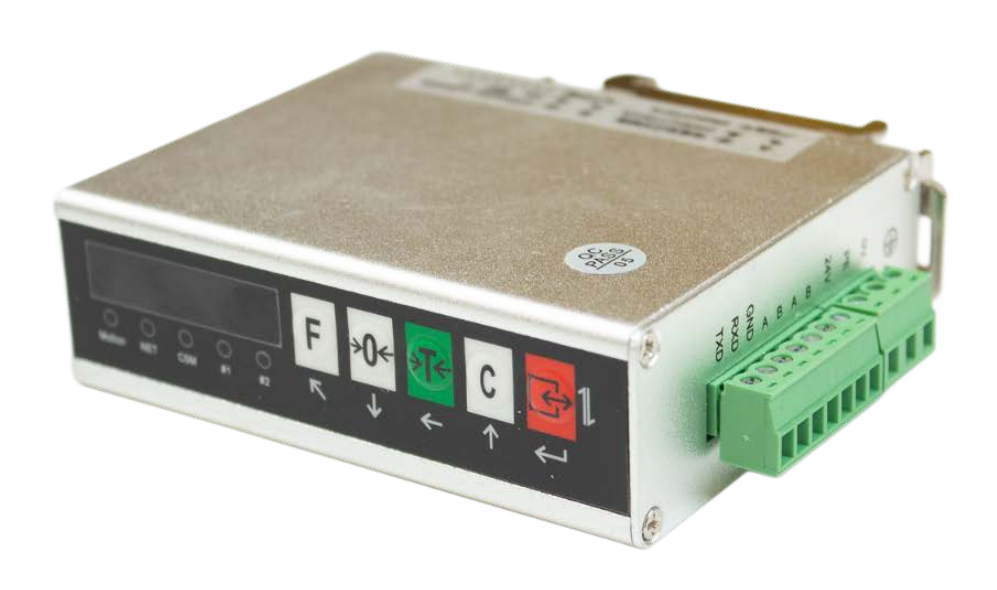
MES-150LC: Single channel Weighing Terminal Dimensions: 92.4x74.5x29 mm