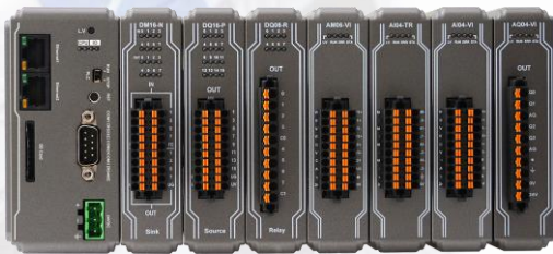
(I/O modules not included)